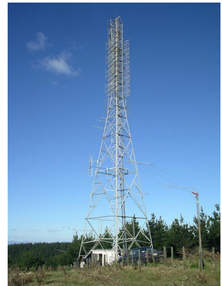
Klondyke Tower Auckland another H&S challenge

Health & Safety is as simple as: STOP – THINK – PLAN and then ACT Look at the back of your ID Card