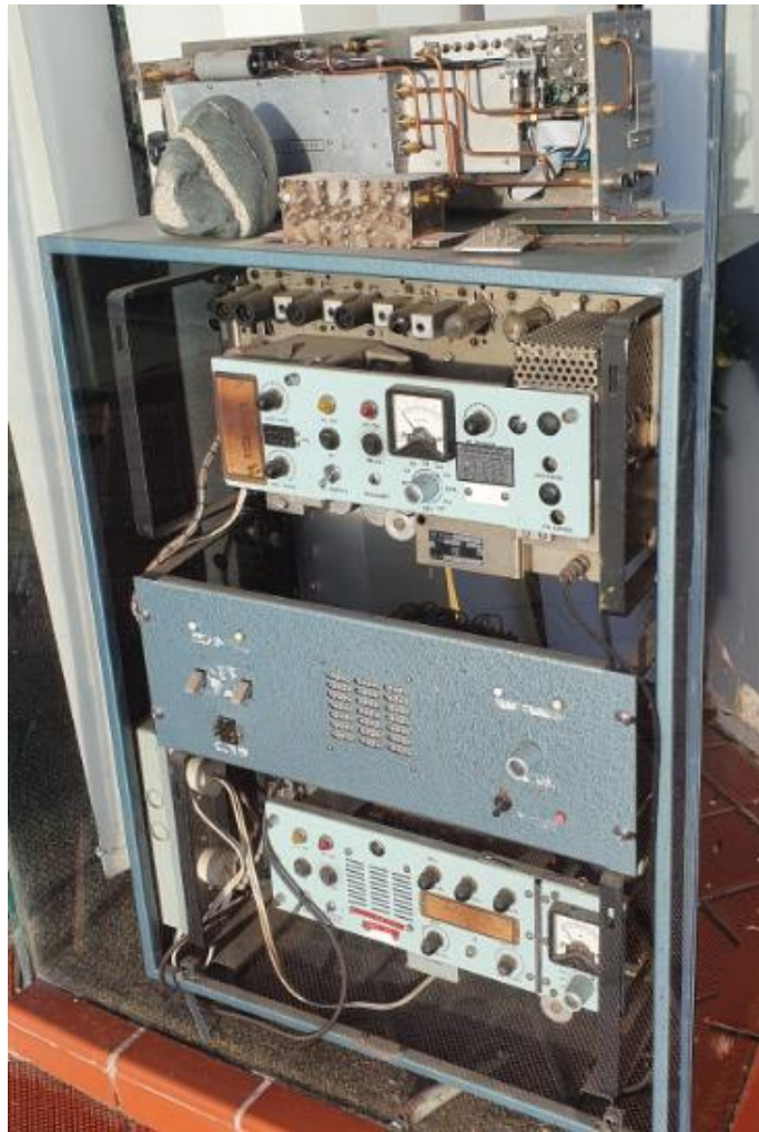
Ian, ZL1RCA, found this on display in a communications shop window in Invercargill. It is an older valve PYE repeater.